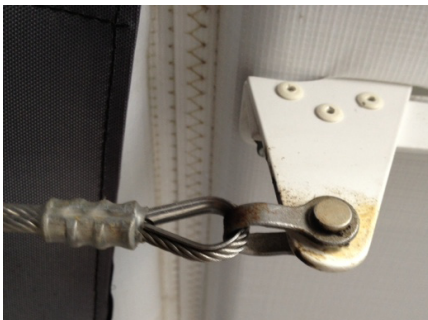
Control Cable Shackle 604

The parts affected are shown below. Both elevator joiner variants could be affected.