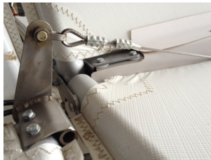
Elevator Joiner 124