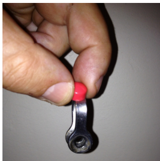
Shackle fails the test by being easily suspended by the magnet

An example video of the test can be found here: tinyurl.com/BMAA-SB-2462